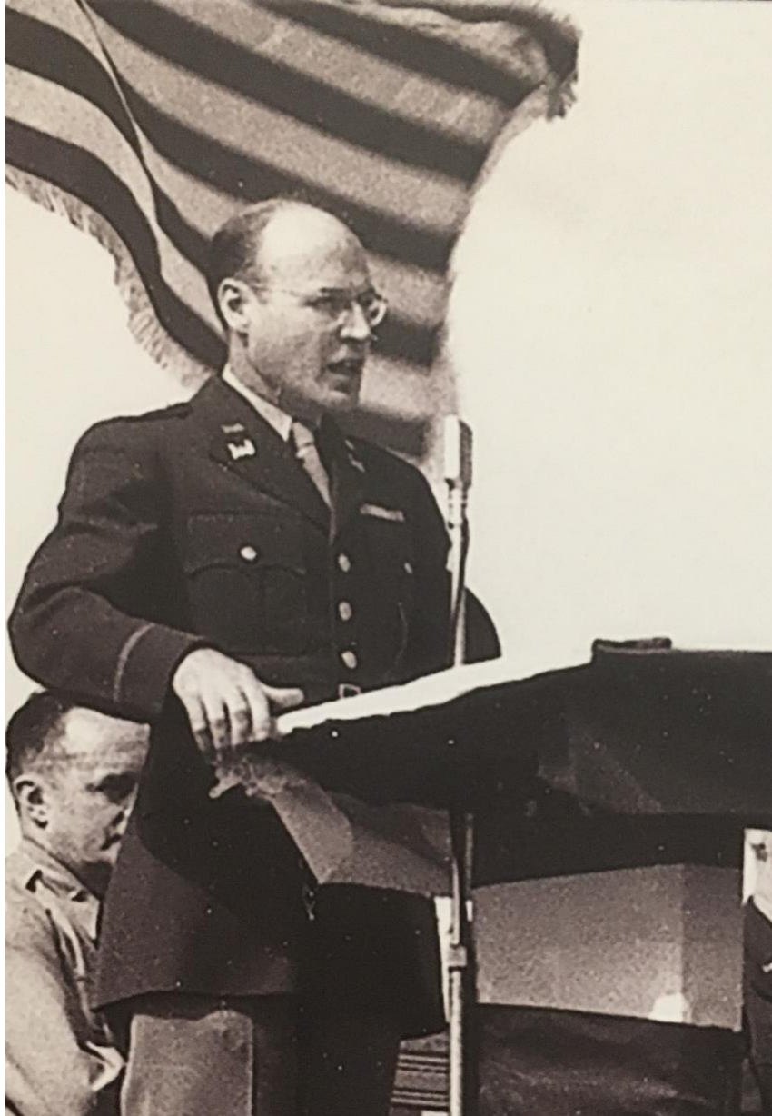
Colonel Kenneth D. Nichols, District Engineer. Dedication of a B-25 Billy Mitchell bomber, SUNDAY PUNCH. Knoxville Airport TN, March 18, 1945.

August 28, 2023 and can be accessed here . https://smithdray1.net/historicallyspeaking/2023/8-28-2023%20SUNDAY%20PUNCH.pdf